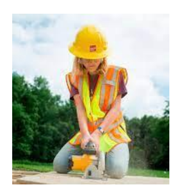
Tools - Hand and Power